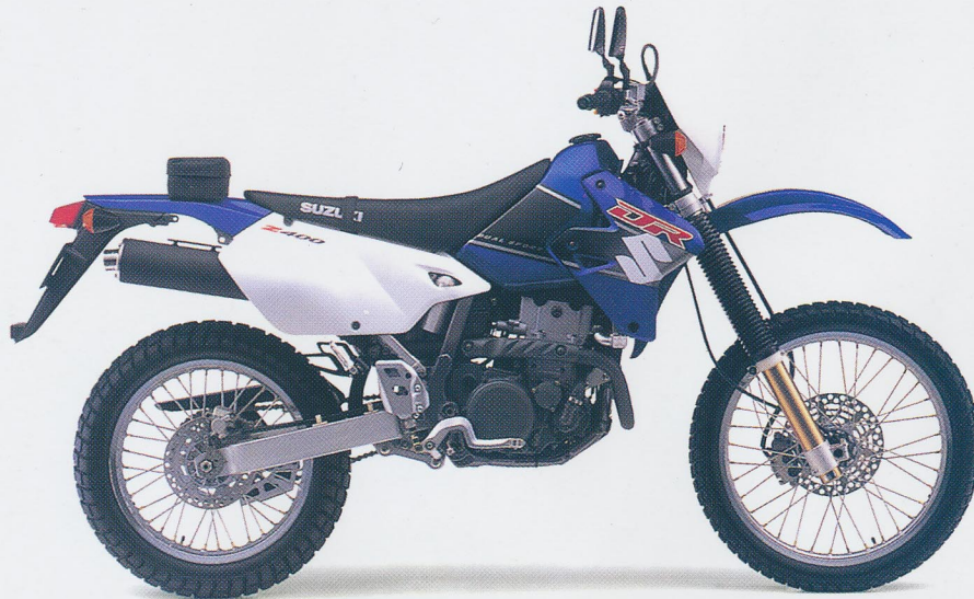
N9J : Candy Grand Blue / Solid Special White No.2