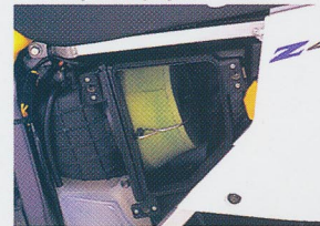
Easy-access air filter