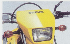
60/55W H4 halogen headlamp