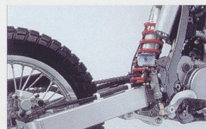
Progressive-linkage rear suspension