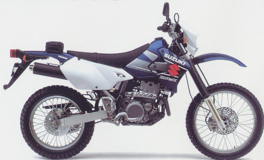
N9J : Candy Grand Blue / Solid Special White No.2