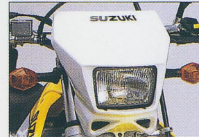
60/55W H4 halogen headlamp