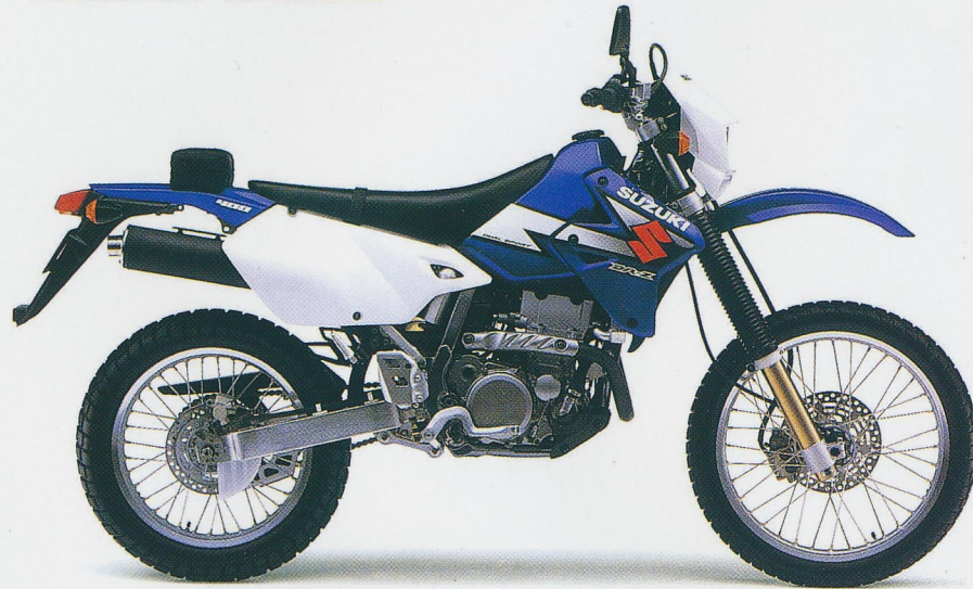
N9J : Candy Grand Blue / Solid Special White No.2