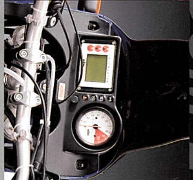
Instrument panel includes Tipmaster, specially prepared for your personal road book.