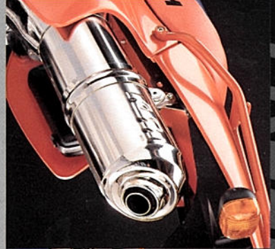
High-grade steel exhaust, carrier rack and enough room for a pillion.