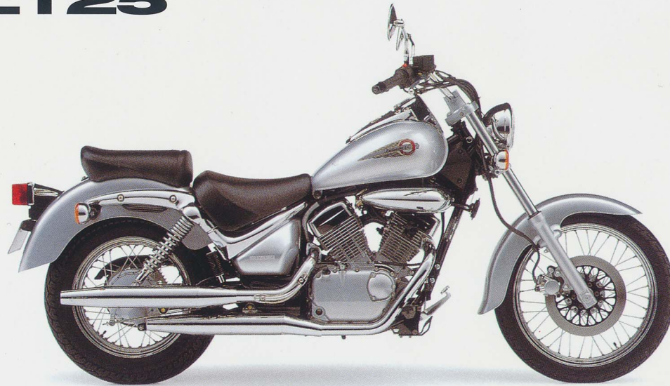
YD8 : Metallic Sonic Silver