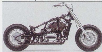
Down-tube cradle frame with "rigid-tail" look