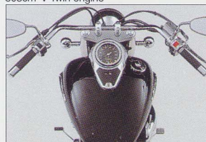
Swept-back bars, tank-mounted speedometer