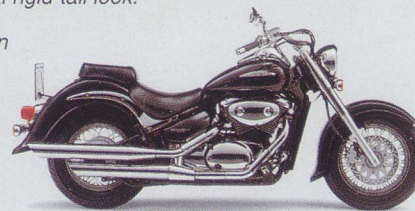
33J : Pearl Novelty Black