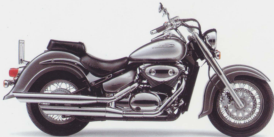
HE6 : Metallic Sonic Silver / Metallic Galaxy Silver