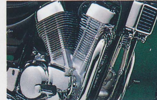
V-twin, 3-valve power plant