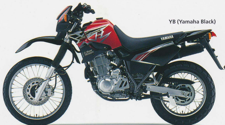
YB (Yamaha Black)