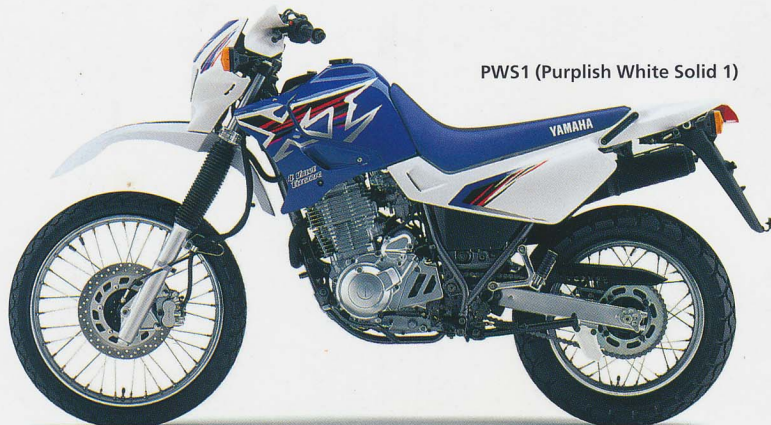
PWS1 (Purplish White Solid 1)