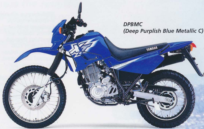
DPBMC (Deep Purplish Blue Metallic C)