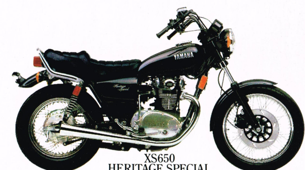
XS650 HERITAGE SPECIAL