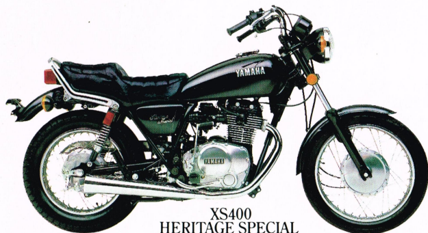
XS400 HERITAGE SPECIAL