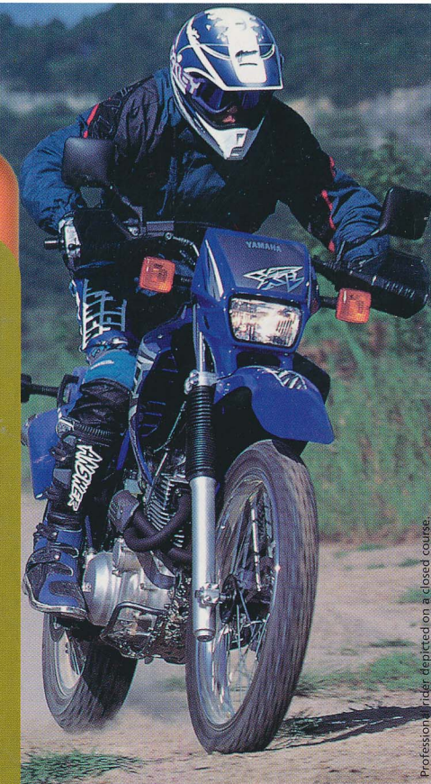
Professional rider depicted on a closed course.

Specifications are subject to change without notice, in accordance with national regulations and legislations.