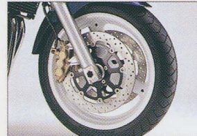
6-piston-caliper front disc brakes