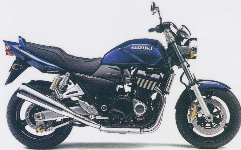
1LF : Pearl Suzuki Deep Blue