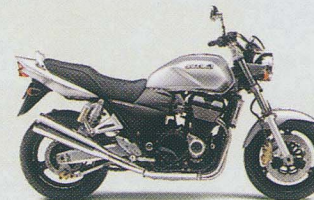
YD8 : Metallic Sonic Silver