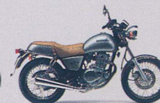
20H : WarmSilver Metallic