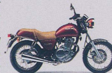
20F : Candy President Maroon