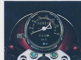
Large, easy-to-read speedometer