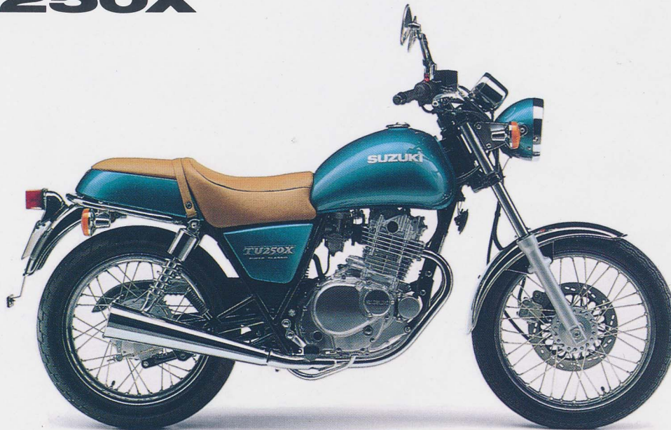
1ZV : Candy Teal Blueish Green