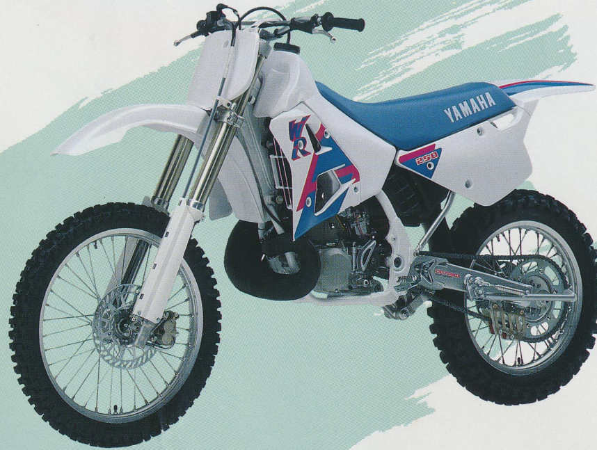
PWS1 (Purplish White Solid 1)

In short, Yamaha have thought of everything—which is why serious competitors think first of the Yamaha WR250Z.