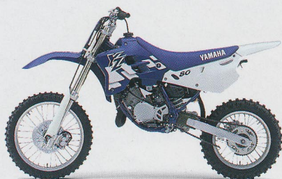
YZ80 IKB (Ink Blue)