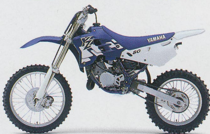
YZ80LW IKB (Ink Blue)